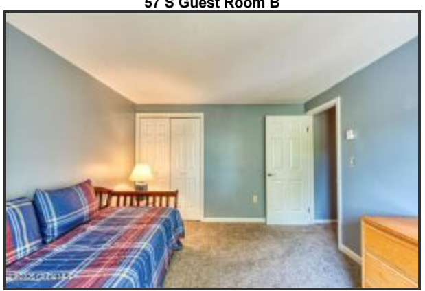
57 S Guest Room B