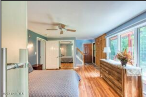
57 S Living Area A