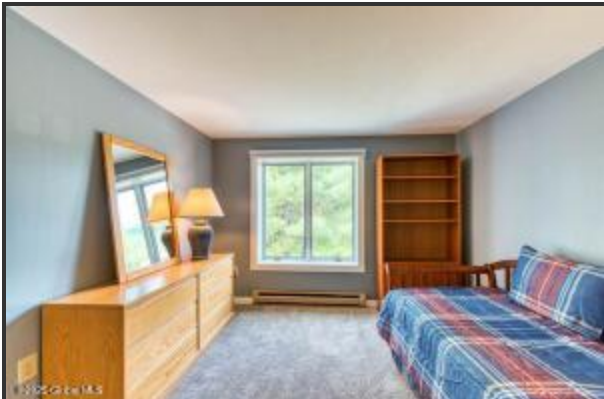
57 S Guest Room B1