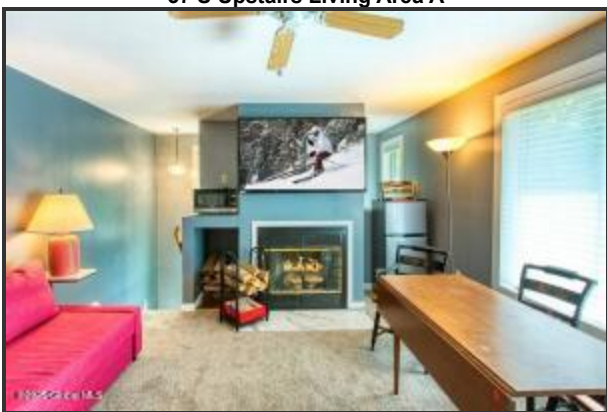
57 S Upstairs Living Area A