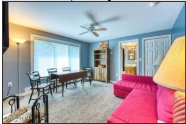
57 S Upstairs Lving Area A1